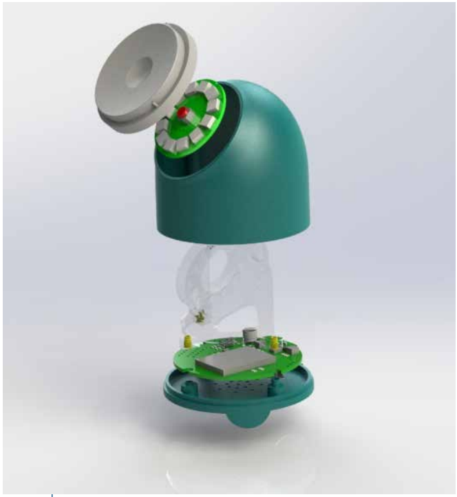
Using SOLIDWORKS design and engineering solutions, MOTI accelerated development of its product of the same name, a personable smart object that helps users establish, form, and maintain better habits.