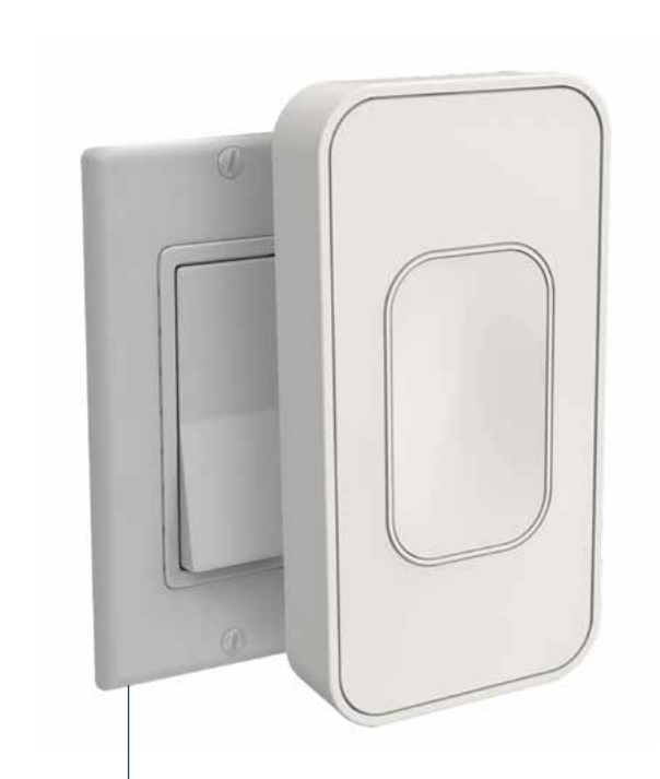
Switchmate relied on SOLIDWORKS design and engineering tools to fast-track development and launch of its product--a simple, easy-to-install light-switch cover that enables users to turn the lights on or off with a companion application on a smartphone.

Switchmate, a Palo Alto, CA, start-up, launched its product of the same name in early 2015 after completing the Highway1 program. The idea behind Switchmate was to create a simple, easy-to-install hardware product that enables users to turn the lights on or off in a home, apartment, or business through a companion application on a smartphone. Unlike previous smart-lighting products, which require taking a light switch apart to hardwire the product in for installation, the Switchmate uses magnets that snap onto the screws of existing toggle- and rocker-switch light controllers to simply and instantly install over an existing light switch. Battery-powered mechatronics within the unit mechanically operate the switch. The Switchmate leverages Bluetooth technology to allow users to turn the lights on or off with either iPhone® or Android™-based smartphones.